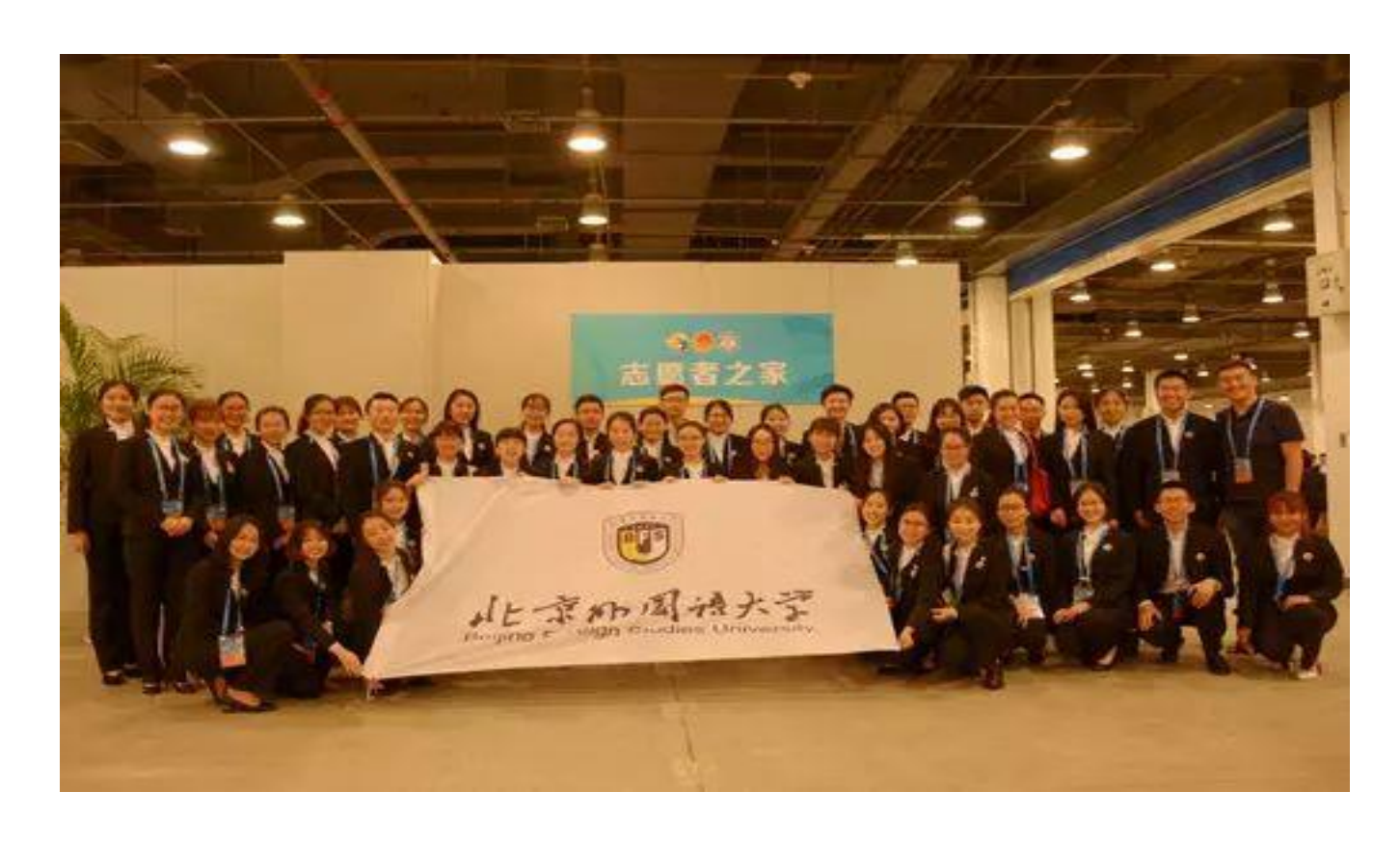
Volunteers for the Belt and Road Forum